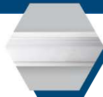
3-SIDED BRICKMOULD W/ 1" SUBSILL OPTION

The Vector EZ Trim is available as a 3-Sided Brickmould with a 1" Subsill or a 4-Sided Brickmould option.